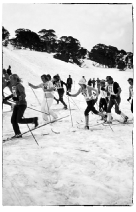
Perisher Cup Langlauf 1972 Glover collection