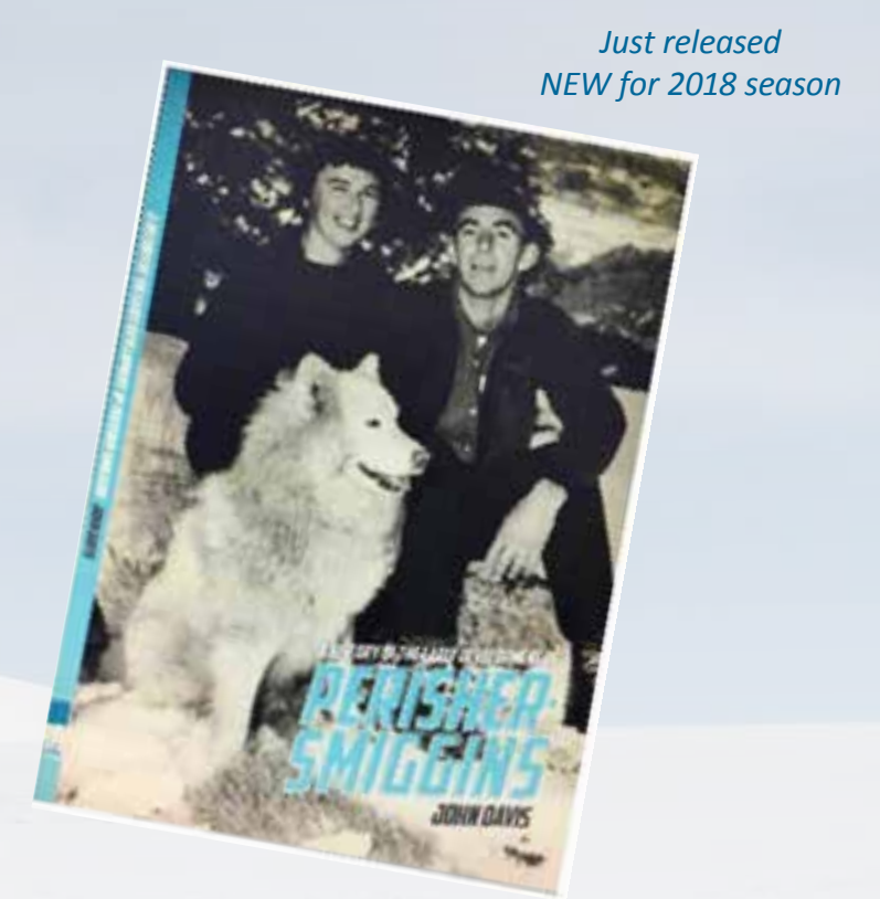
Published by the Perisher Historical Society

Have you got your copy? The How The Who The Fun