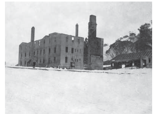
All that remained of the Hotel Kosciusko after the 1951 fire (image courtesy of the Laurie Bell collection).