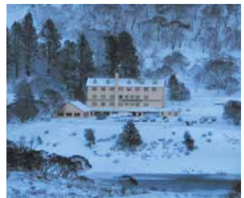
Sponar's Chalet today - remnants and renovations of the original Hotel Kosciusko.