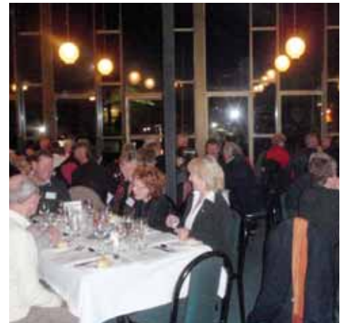
Dinner guests at The Man from Snowy River Hotel – fine food and history were enjoyed by all.

Perisher Historical Society is most grateful to The Man from Snowy River Hotel for generously donating the profit of $2,100 from the dinner to the Society.