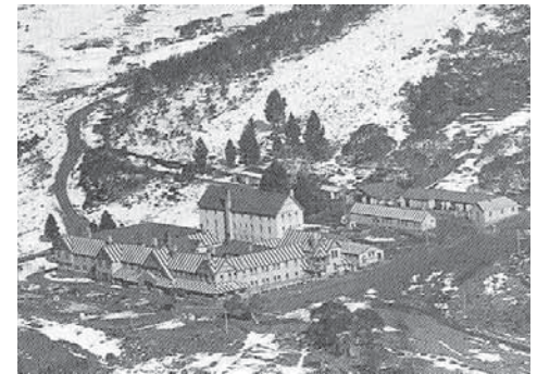
An aerial view of the Hotel Kosciusko in 1946