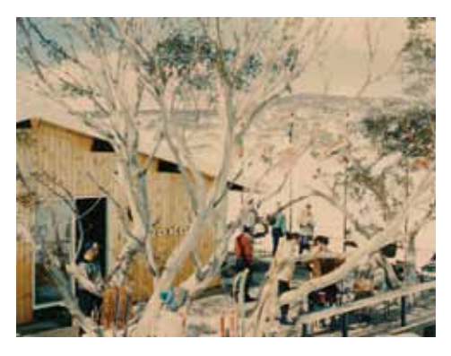
The Sundeck Hotel in 1959.

Perched above the 'front-valley' ski slope, the Sundeck Hotel has an enviable location and is a truly ski-in – ski-out establishment. As Australia's highest hotel at an elevation of 1769 metres, the Sundeck now has 90 beds and can still boast some of the best winter entertainment in the mountains.