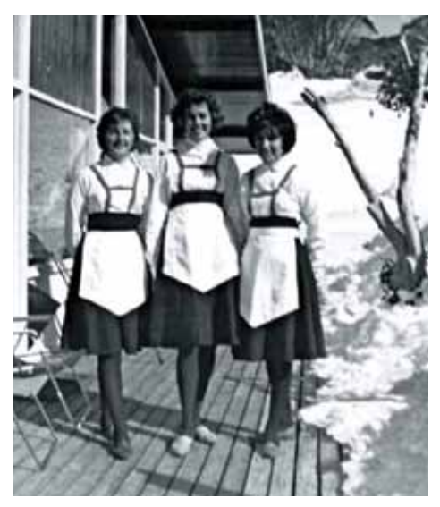
Sundeck employees from an earlier era.