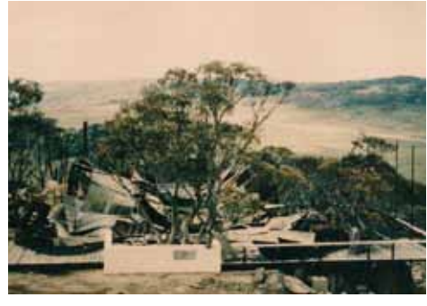
The remains of Sundeck Hotel after the fire of January 1960.