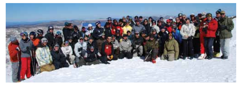
Perisher staff and other members of the ski community were present to celebrate the opening of 'Shifty's Run' on Mt. Perisher.