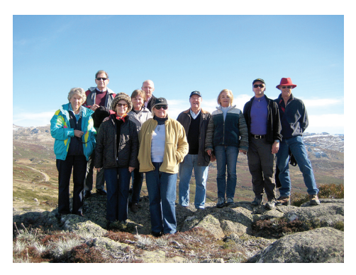
Members of the Perisher Historical Society on the side of Mt. Stillwell.