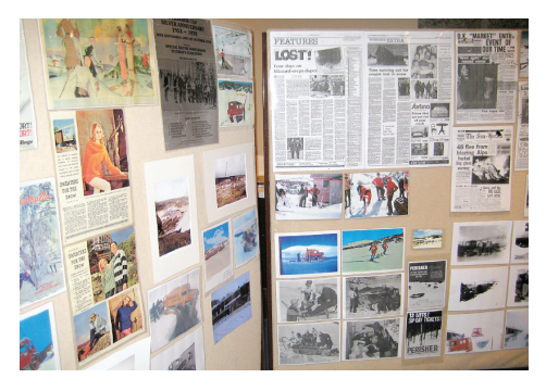
Images of an earlier period in the history of the Perisher Range Resorts.