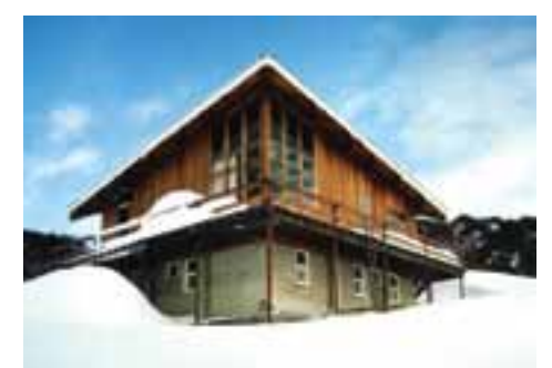
Ku-ring-gai Alpine Lodge as it was in winter 1964.