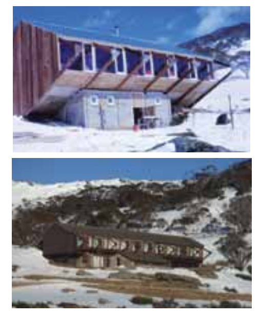
Yaraandoo during first stage construction (1962) and 50 years later.

The striking design Is Terry Dorrough's, and it amply met the brief: to hold a total sleeping accommodation of 12 single bunk beds in two rooms, each with its own toilet and shower; for these bunk rooms to be located around a common living and