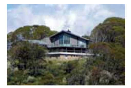
Ku-ring-gai Alpine Lodge as it is today, summer 2012.