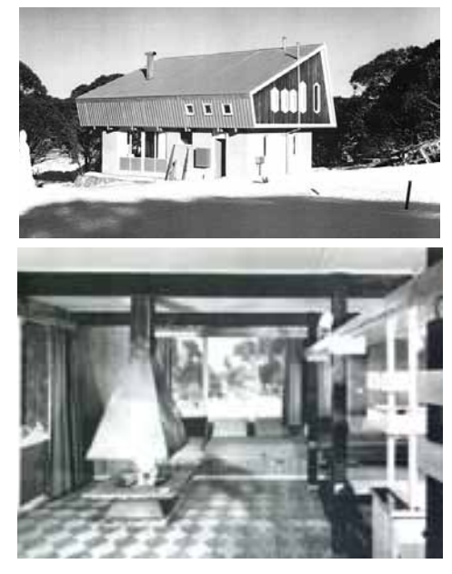
Early days at Dulmison.

In the years since, the building has been upgraded and extended four times. It now offers a mix of 20 ensuite beds and bunks with ample living facilities as well as the lodge manager's flat.