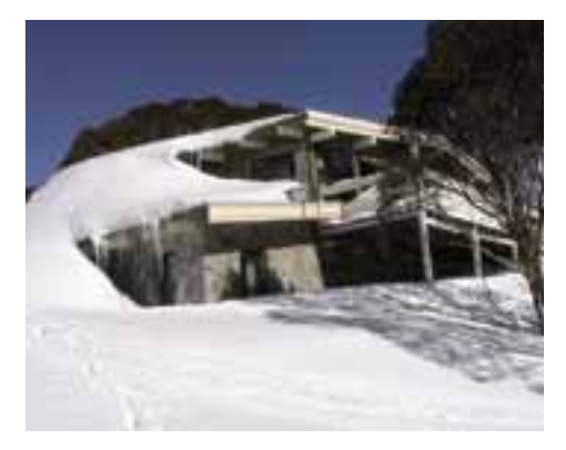
Fjellheim, current day.

Our club membership remains open only to those descendants of the original founding members, along with two new families who joined our 'family' in 2010. We remain a group of people firmly committed to providing a terrific, enjoyable place for skiers to enjoy their sport. So on the 31st March 2012, at Newport Surf Life Saving Club, our celebrations really felt like a gathering of relatives!