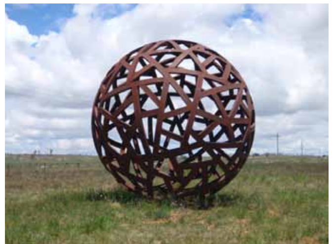
'Snowy River Sphere' by Richard Moffatt east of the Snowy Mountains Airport.

The artists were asked to consider the dramatic Snowy Mountains landscape, social history and aspects of economic development, and then create a large scale artwork that captured these elements. In assessing the artistic merit of the submissions, members of the shire's Public Art Advisory Panel also had to consider design, budget, excellence, relevance and maintenance. A number of locations were proposed by the shire's Public Art Advisory Panel, with final approval resting with the then RTA (now RMS).